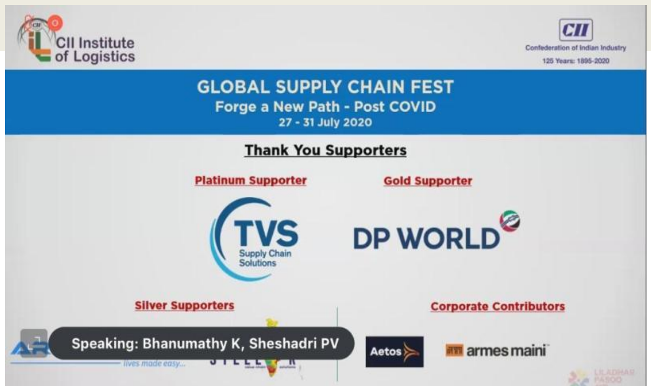
Confederation of Indian Industry organized a Global Supply Chain Summit post COVID-19 19.